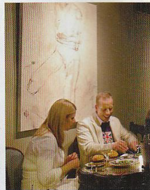
Wine goes with burgers at Rootstock, with books at Prairie Lights and with cheese plates at By the Ounce.