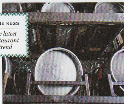
WINE KEGS the latest restaurant trend